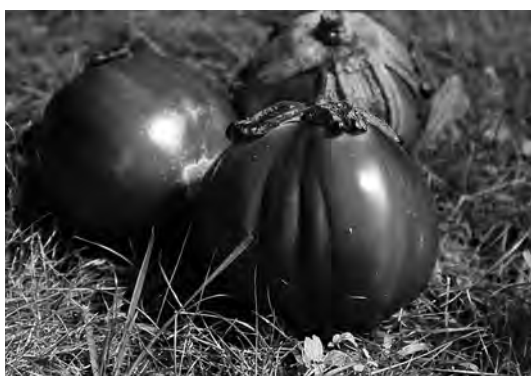
Eggplant in the garden.