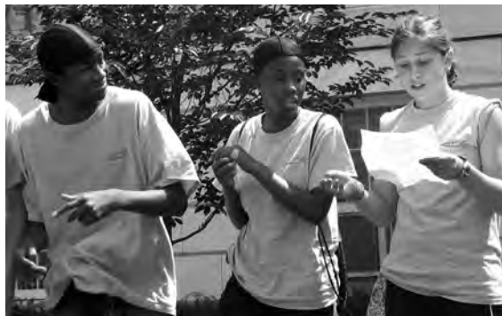
Summer Growing Program participants presented "Veggie Theater" at the Downtown Schenectady Farmers' Market this summer.